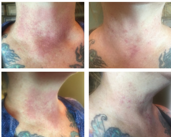
DAY 0 | DAY 1 Immediately following treatment | 24 hours post peel

“As my initial pictures indicate, I had a reaction to a peel. I applied Recovery over half of my neck. The second set of pictures shows my neck roughly 24 hours later. The side that I put Recovery on completely calmed down. The side I did not apply Recovery to blistered and was very painful. As a licensed aesthetician I highly recommend using Recovery post chemical peel.” - S.Y.