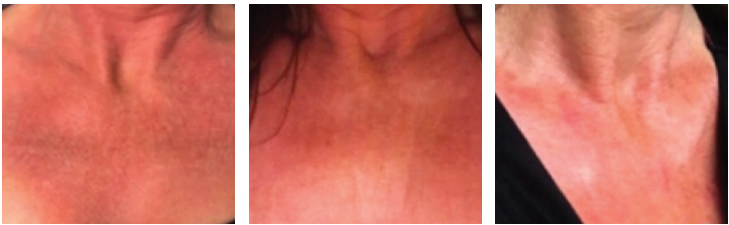
DAY 0 DAY 2 DAY 4

“I have tried out a variety of treatments and this is the most aggressive one. I was concerned about the downtime and my comfort level. I didn't miss any work and the Recovery product when applied had a cooling effect of the heat. I am very impressed by the results; I used Recovery only on my face and you can see how well it reduced the redness by the second day, compared to my décolleté that I didn't use the Recovery on.” - P