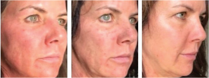
DAY 0 DAY 2 DAY 4