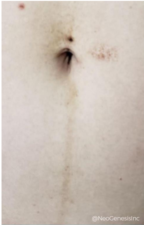
DAY 0 Scar under navel